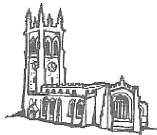
St. Michael and All Angels