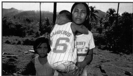
The church in the Philippines is reaching out to rural communities

The global threat of swine flu, along with an increased prevalence of dengue fever and malaria, has galvanized the Philippines' government to roll out an upgraded environmental sanitation programme. However, government services do not reach the country's most remote regions, which is why the Episcopal Church of the Philippines (ECP)