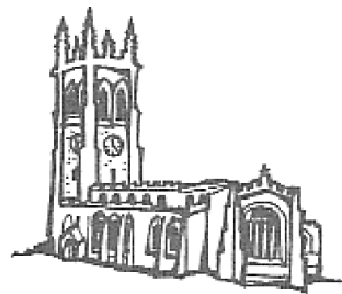
St. Michael and All Angels