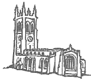
St. Michael and All Angels